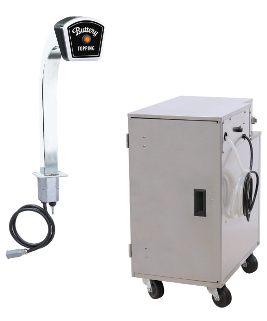
Model without photo-eye shown above. Countertop to be provided by customer.